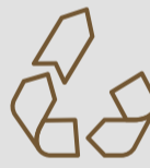
High-end application of local waste