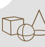
Any shape & size