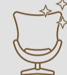
New look & feel