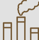
CO 2 emissions