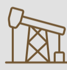
Fossil based materials